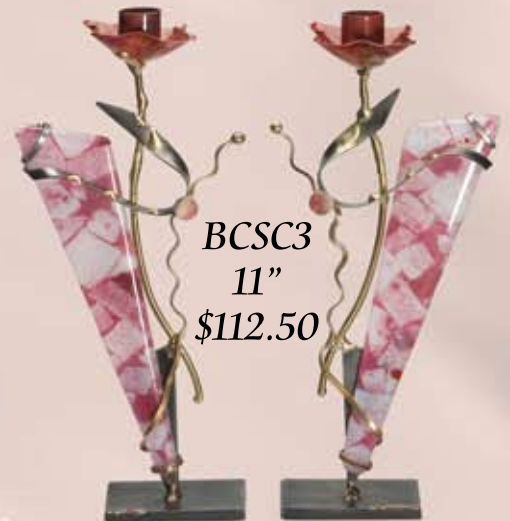
BCSC3 11" $112.50