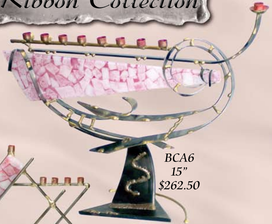
BCA6 15" $262.50