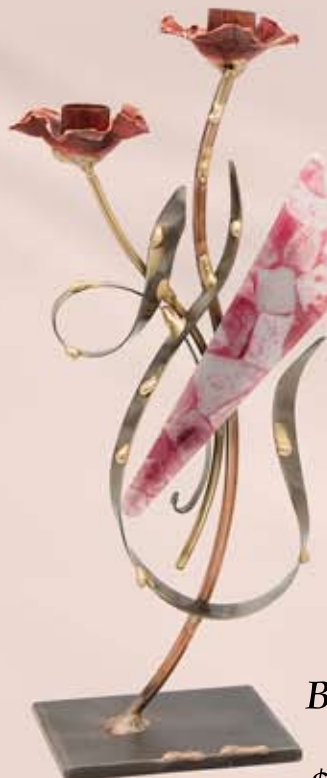
BCSC4S 14" $112.50