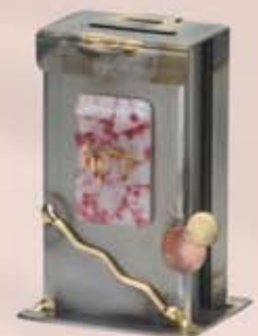
BCTBMG 4.5" $52.50