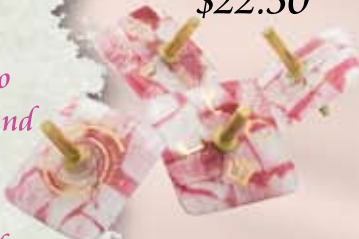
BCDT2 2" Square $22.50