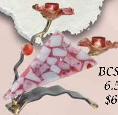
BCSC7 6.5" $60