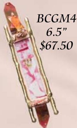
BCGM4 6.5" $67.50