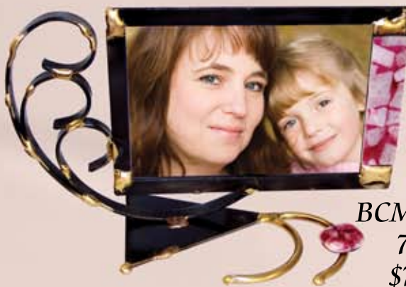
BCMPF8 7" $75